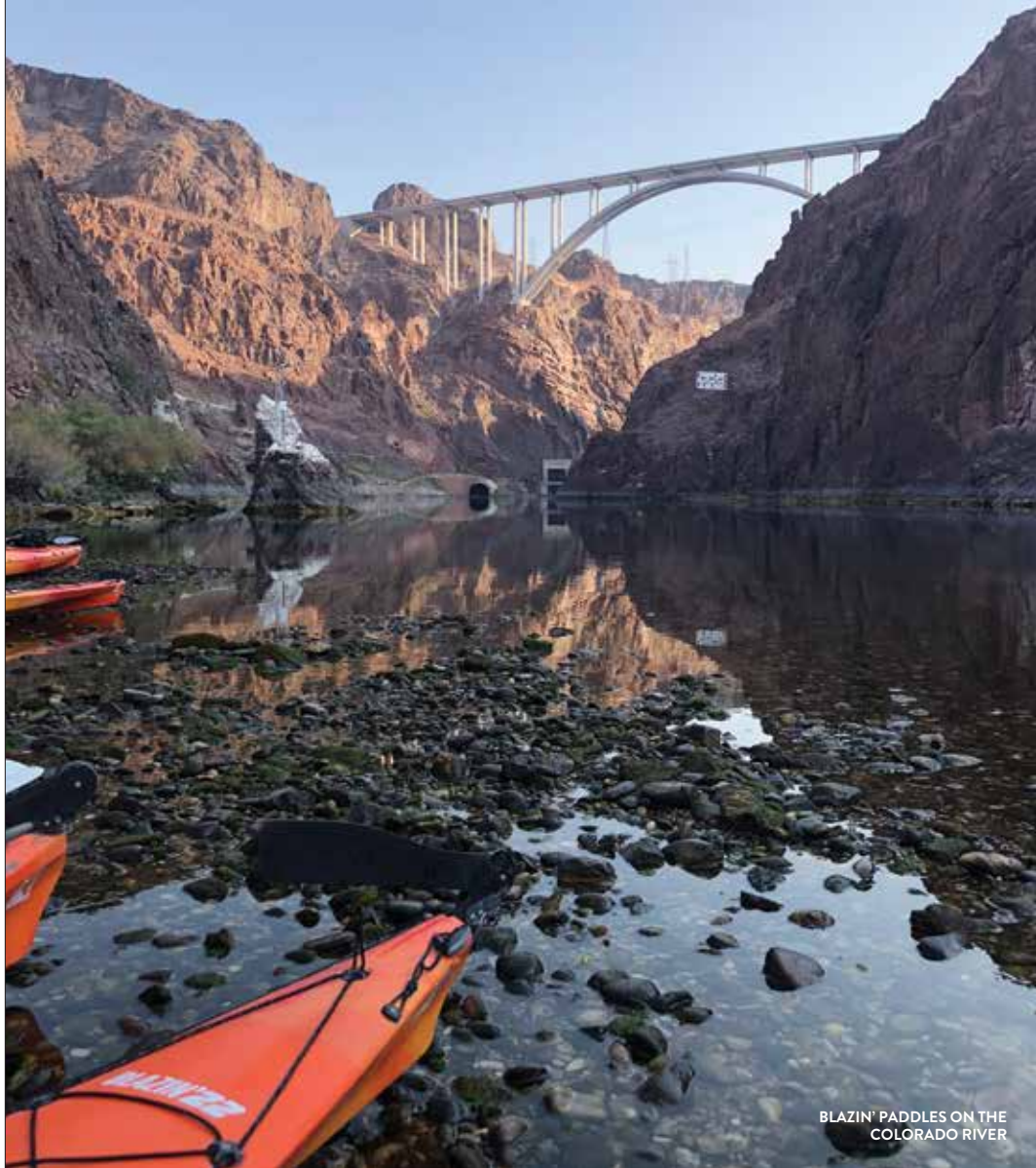
BLAZIN' PADDLES ON THE COLORADO RIVER

5-week Climbing Academy teaches young climbers, ages six and up, foundational skills and techniques. Courses like Belay Basics and Lead Climbing Basics help adult climbers master ascents and descents.