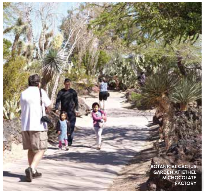
BOTANICAL CACTUS GARDEN AT ETHEL M CHOCOLATE FACTORY

the tour of this factory named for the mother of famous chocolatier Forrest Mars Sr., you can watch chocolate being made according to Ethel's original, unchanged recipe. Walk off any calories from the tasty treats by strolling through the three-acre botanical garden. With over 300 types of cactus, this is a popular holiday spot when