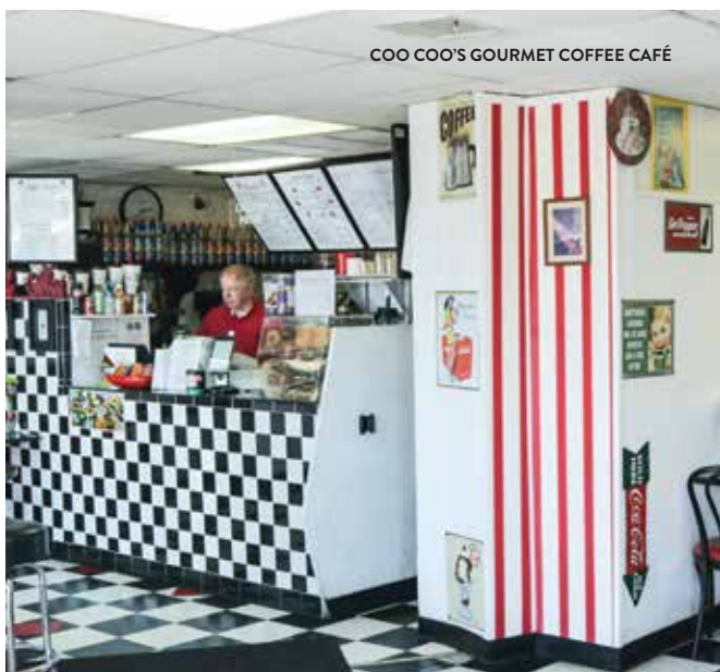
COO COO'S GOURMET COFFEE CAFÉ