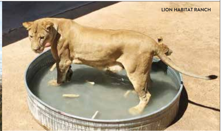
LION HABITAT RANCH

and plenty of elbow room, every student leaves with a piece they're proud to hang on the wall.