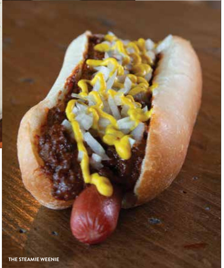
THE STEAMIE WEENIE

the Iowa State Fair; and the PBB & JJ, a bacon-wrapped Nathan's frankfurter with creamy peanut butter and jalapeno jelly. Everything here rings in under $7.